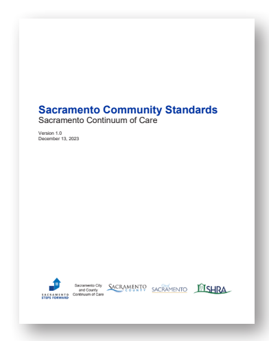
CoC's new Sacramento Community Standards

It is critical to review quantitative and qualitative data related to service access, quality, and outcomes with an equity lens to understand the impact assistance has on different subpopulations experiencing homelessness and where adjustments are needed. System monitoring should include ongoing and direct engagement with people with current and past lived experience, as well as a comparison of each <a href="mailto:system-level performance">system-level performance</a> measure disaggregated at a minimum by race, ethnicity, gender identity, and disability status. Analysis of 2022 Point-in-Time Count and calendar year 2022 data completed for the All In Sacramento planning process revealed several inequities across these key measures, as detailed in <a href="mailto:Appendix5">Appendix 5</a>. The CoC Racial Equity Committee will use these data to inform an updated Racial Equity Action Plan to be published later in 2024.<sup>6</sup>