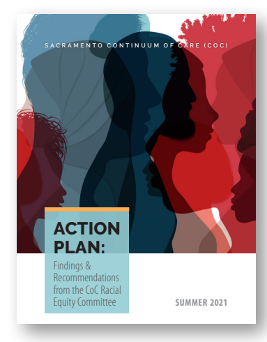
CoC's Racial Equity Action Plan