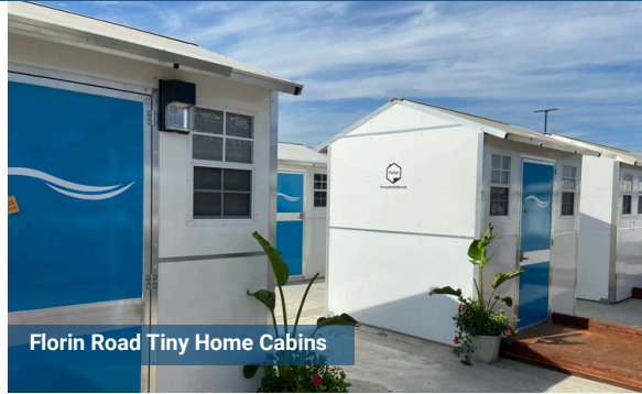
Florin Road Tiny Home Cabins