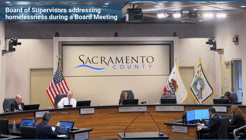
Board of Supervisors addressing homelessness during a Board Meeting