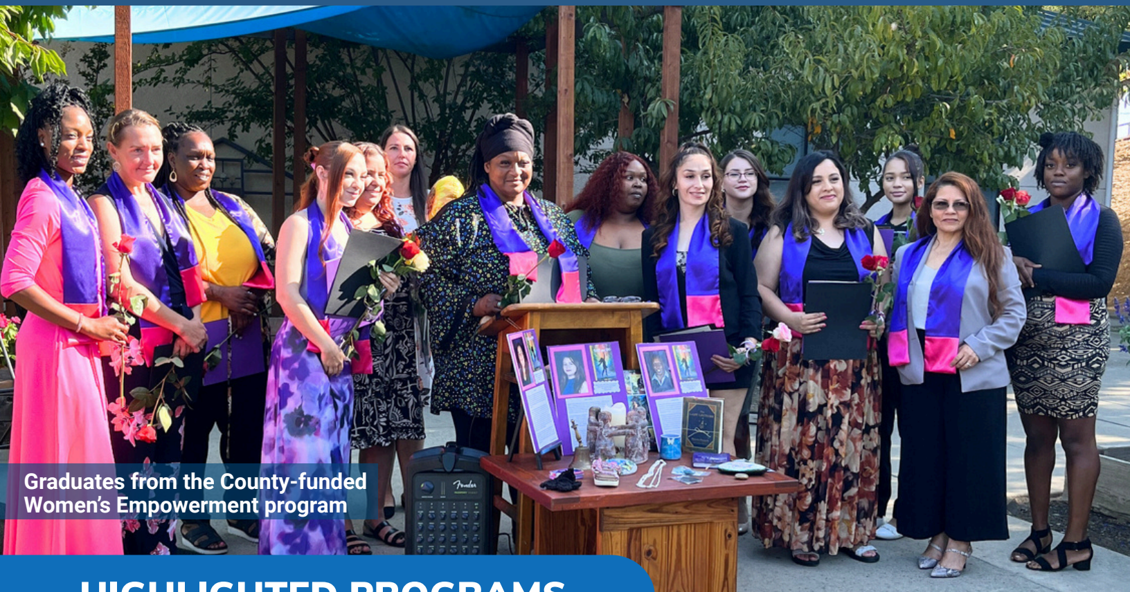
Graduates from the County-funded Women's Empowerment program