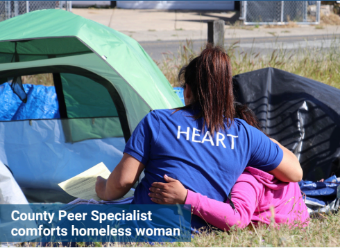
County Peer Specialist comforts homeless woman