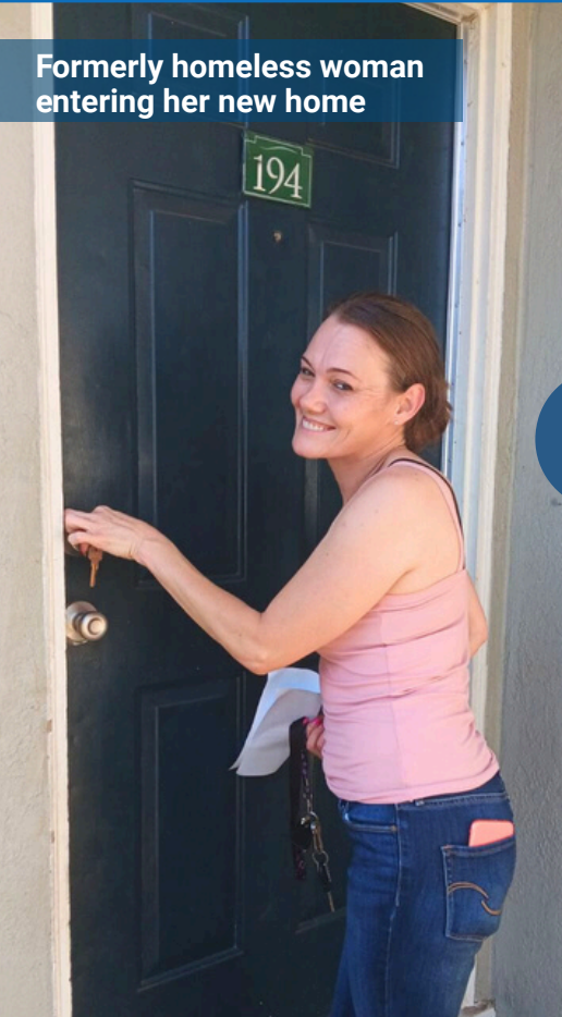
Formerly homeless woman entering her new home

7,900+ PEOPLE SERVED through Outreach, Navigation and Shelter Services