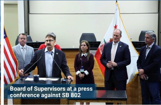
Board of Supervisors at a press conference against SB 802

The following information is a synopsis of programs and outcomes addressing homelessness between 2021-2025. This information is a snapshot of the diversity of the programs Sacramento County has invested in the last four years and many of the outcomes associated with those programs. Not all programs started in 2021, but the outcomes listed are since the programs creation. The County partnerships and collaboration with cities within the County are also highlighted, as well as several programs that are under construction and opening in 2026.